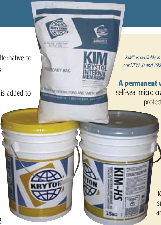
KIM® is available in 5 and 25 KG (11 & 55lbs) buckets and our NEW 10 and 15KG (22 & 33lbs) Mixer-Ready Bag

A permanent waterproofing solution - KIM® has the unique ability to self-seal micro cracks that develop anytime in the life of the concrete. KIM® protection lasts. We guarantee it!