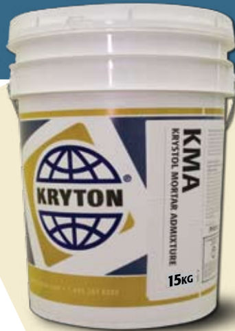
KMA is available in 15 kg (33 lbs.) pails