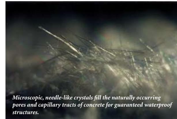
Microscopic, needle-like crystals fill the naturally occurring pores and capillary tracts of concrete for guaranteed waterproof structures.

When added or applied to concrete, crystalline chemicals create a reaction that causes long, narrow crystals to form, filling the pores, capillaries and hairline cracks of concrete. As long as moisture remains present, crystals continue to grow throughout the concrete, reaching lengths of many inches over time.