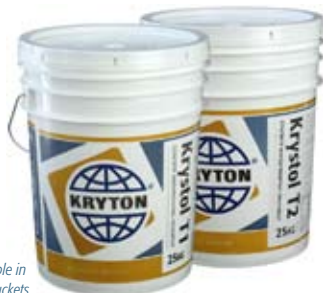
Krystol T1 & T2® are available in 5 and 25 KG (11 & 55lbs) buckets.

Paths for harmful moisture and aggressive chemicals are blocked. Permanently.