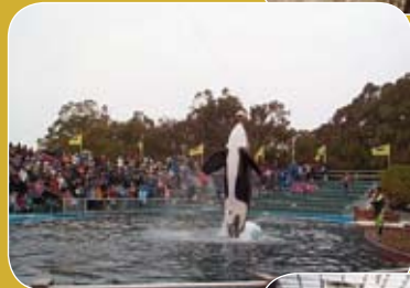
Aquariums, Pools & Spas, Fountains, Aquatic Centers