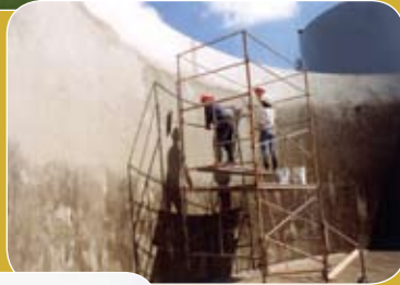
Water Reservoirs, Water Treatment Plants, Water Towers