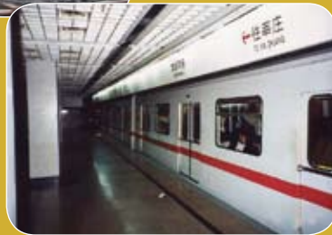
Subway Tunnels, Pipelines, Bridges & Dams