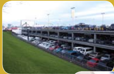
Below Grade Parking Structures, Elevator Pits and Slabs